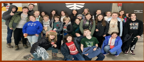
A group of students that made the quarter one honor roll enjoyed a Dartmouth College Women's Hockey game - December 1 st .