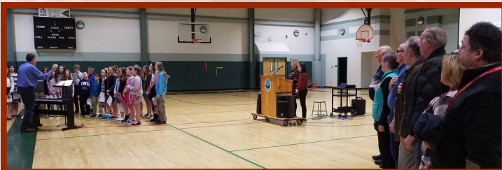
Veteran Appreciation Breakfast on November 9th.