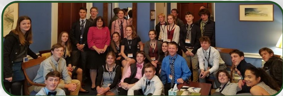
CloseUp Trip to Washington DC